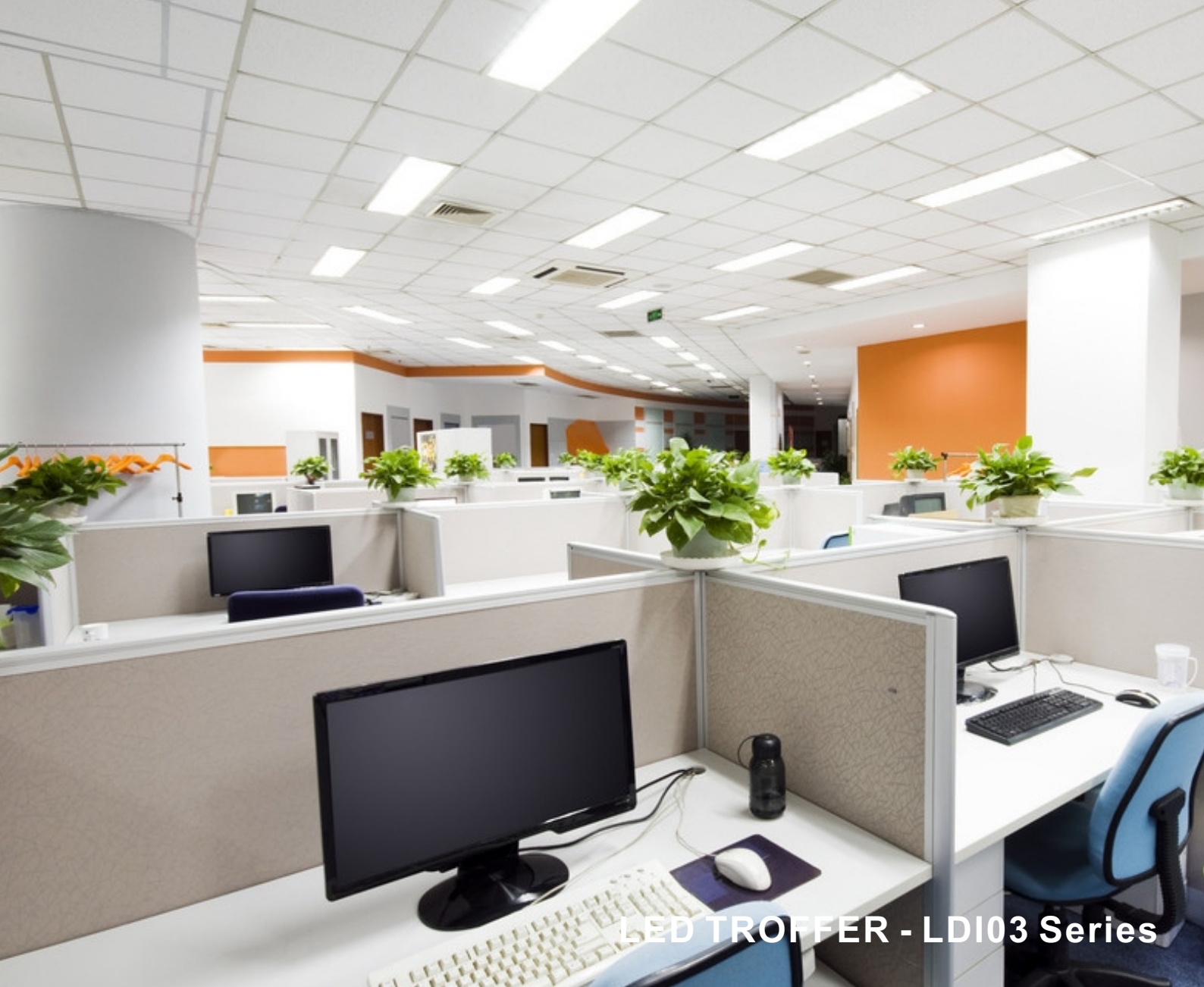
LED TROFFER - LDI03 Series

HOSSONI LDI03 series is an energy efficient commercial fixture that features high lumen and glare reduction. The LED incorporate a full metal fixture liner inside the housing with a high impact diffuser. HOSSONI LDI03 series is suitable for interior applications and can be placed on traditional office T-rail. HOSSONI LDI03 series has been designed to operate commercial institutions such as hospitals, offices, schools. It has a stylish design with soft lumens that provides a comfortable working area.